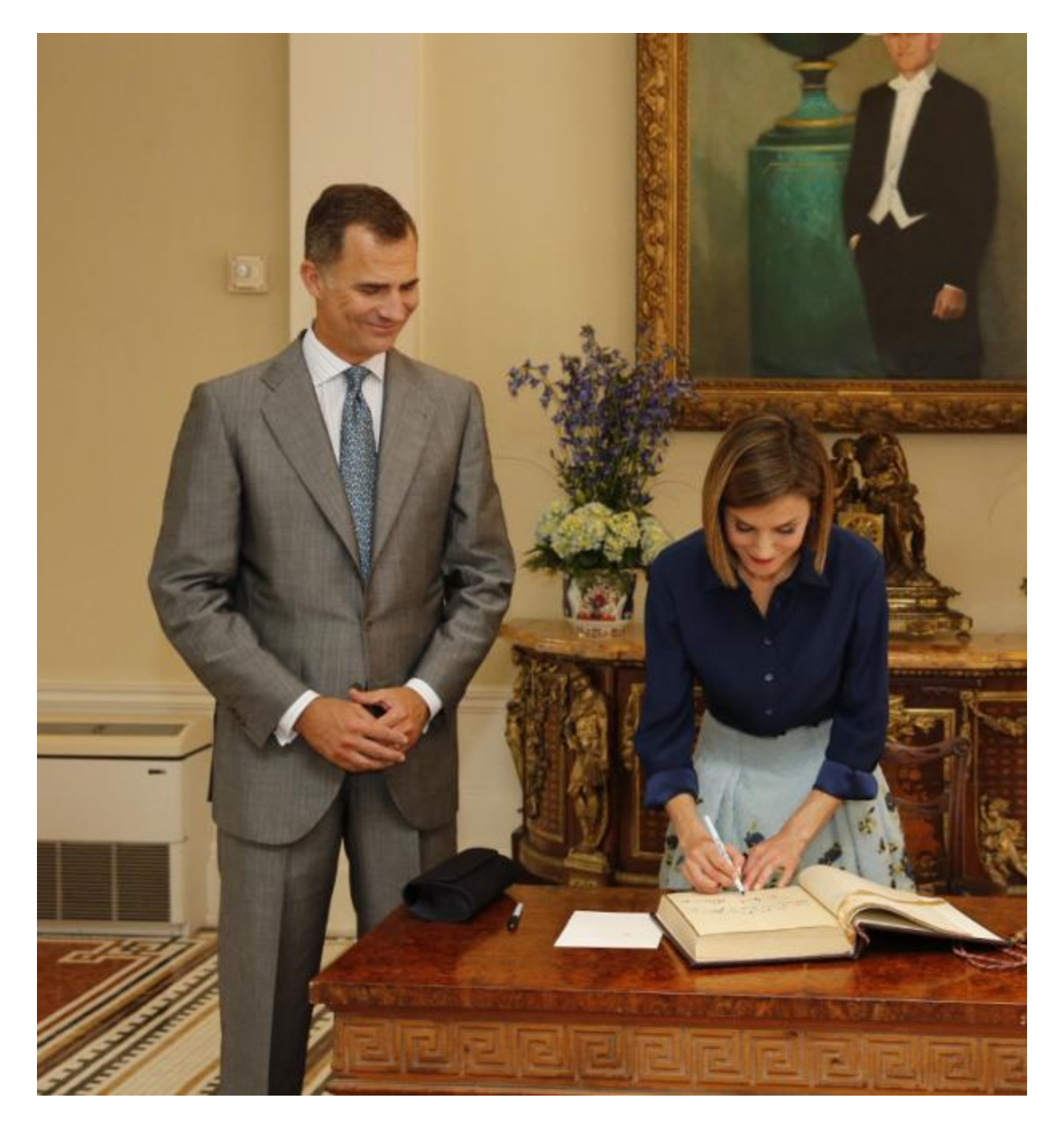
The King And Queen Of Spain Visit St Augustine